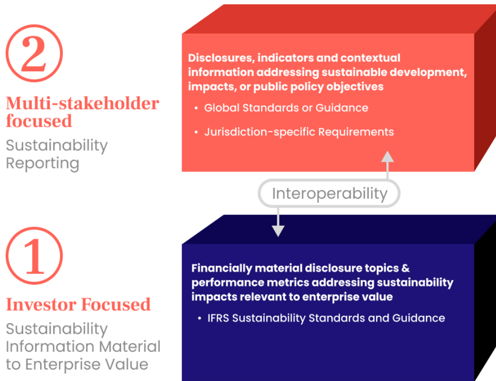
Figure 3. IFAC Building Block Approach to Sustainability Reporting